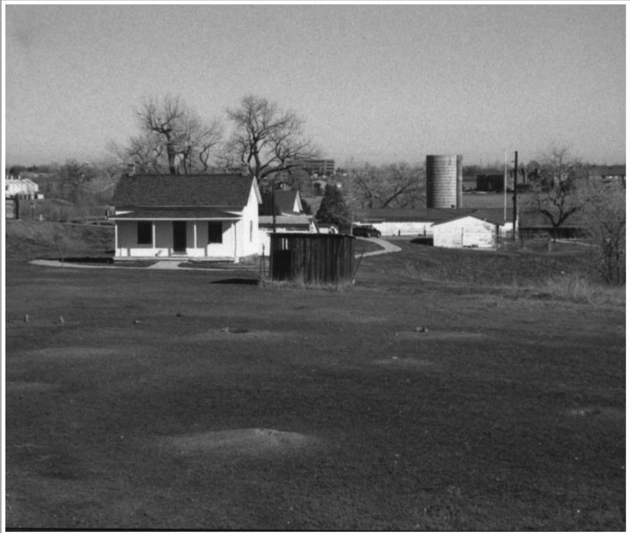
Gully Homestead with outbuilding 1944, city of Aurora