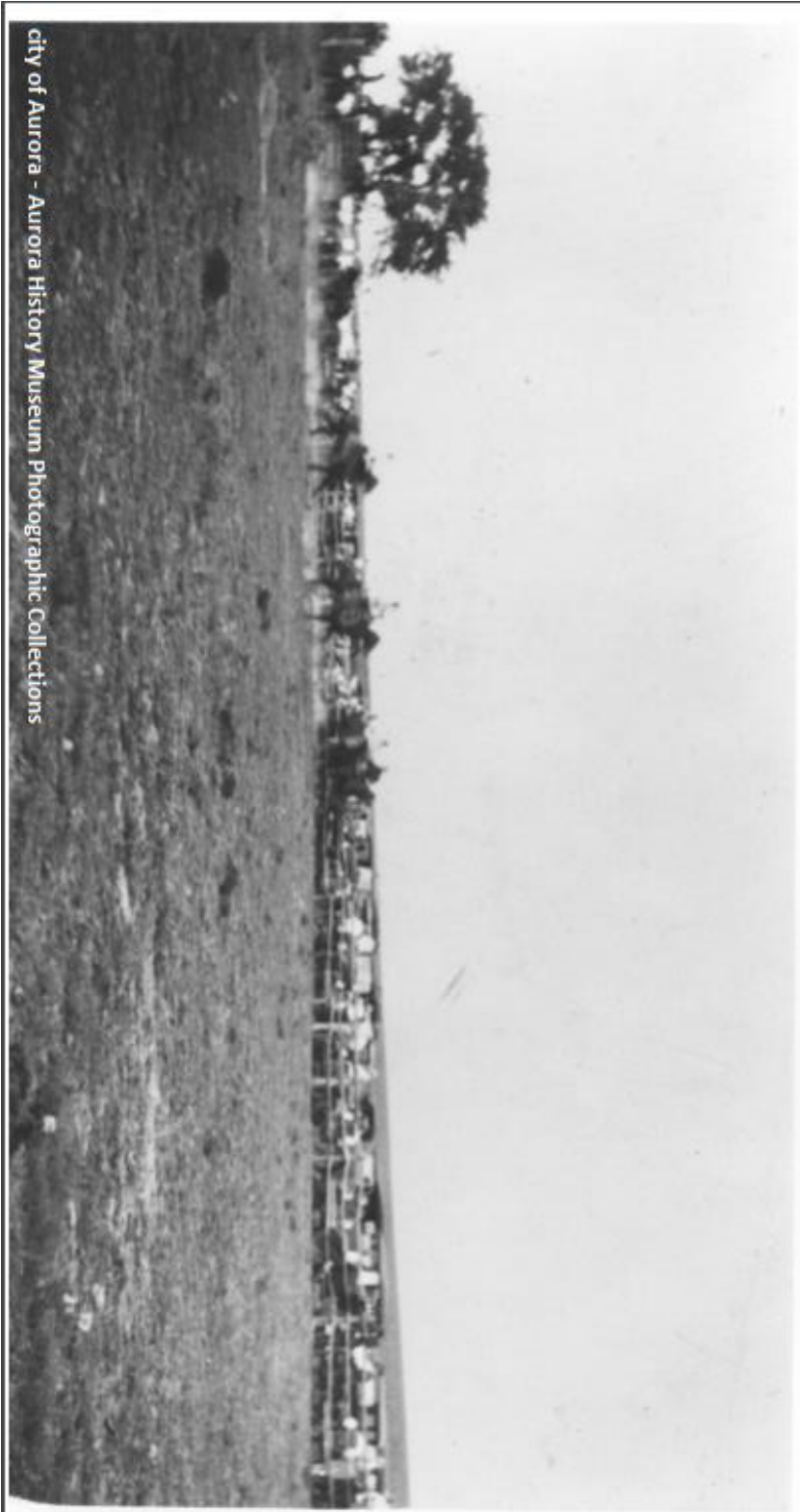
Rodeo 1920-1950, City of Aurora