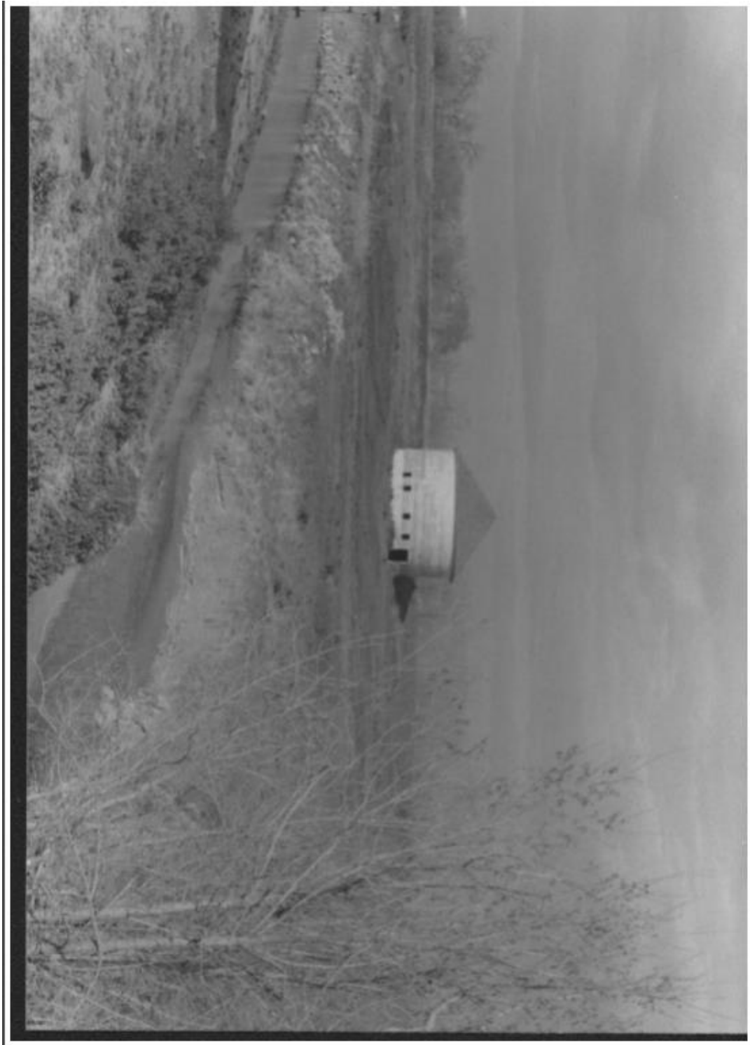
Delaney Round Barn

*This Round Barn was built in its current location around 1902. It was built as a silo, the opening for grain was cut into the northeast facing, lower part of the roof.*